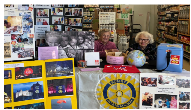
A big "Thank you!" to all of our volunteers who helped raise money for Polio eradication