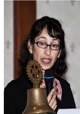
Last Week's Speakers: