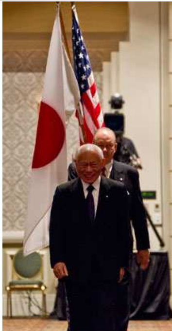
RI President-elect Sakuji Tanaka leads the flag procession during the opening plenary session of the 2012 International Assembly on 16 January in San Diego,