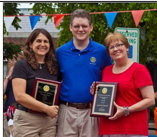
Last year's winners