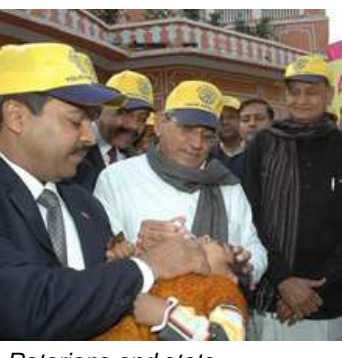
Rotarians and state government leaders in Jaipur. Rajasthan, India, vaccinate children against polio during a National Immunization Day in 2011