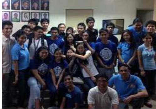
The Rotaract Club of Los Baños, Laguna, Philippines