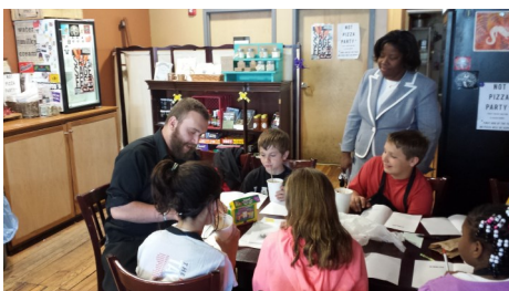
Students learn the steps in building a daily menu at Hobb's

During the World of Work, students at the Swarthmore-Rutledge (SRS) elementary school visited businesses in the Swarthmore Village Center. After visiting the businesses, the students demonstrated their ideas and inventions for new products, along with the marketing, research and development and costing aspects of bringing an invention or idea to market. Thanks to all the Club Members who volunteered to help this happen!