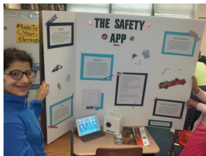
Two of the many clever and useful inventions created by the students at SRS