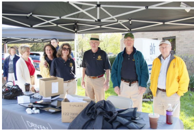
They got up early to drive the cars from Springfield Ford