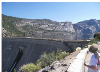
Face of O'Shaughnessy Dam