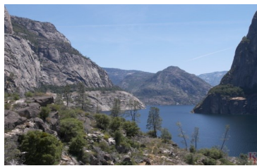
View of Hetch Hetchy Reservoir