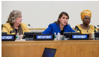
A panelist makes a point during the 2014 Rotary Day at the United Nations.

Ask almost anyone at the United Nations and they will know that Rotary, having helped to spearhead the Global Polio Eradication Initiative, has contributed to the 99 percent worldwide reduction in polio cases since the initiative began.