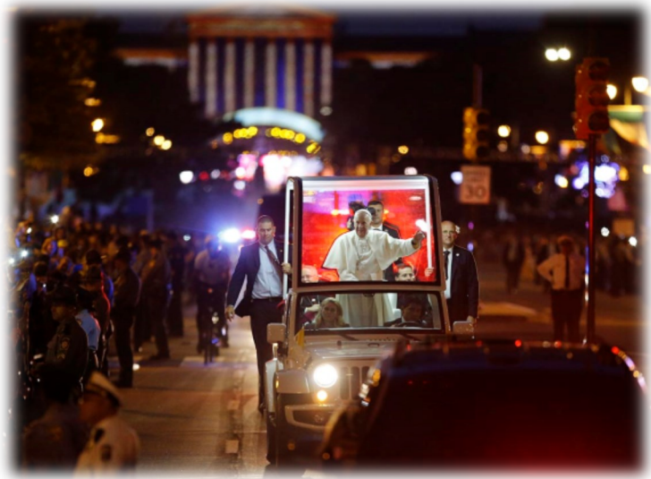
Pope Francis waves to the crowd gathered for the Benjamin Franklin Parkway to the Festival.