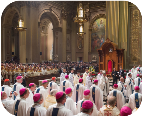
Pope Francis arrives at the Cathedral Basilica Sts. Peter and Paul to conduct a mass.