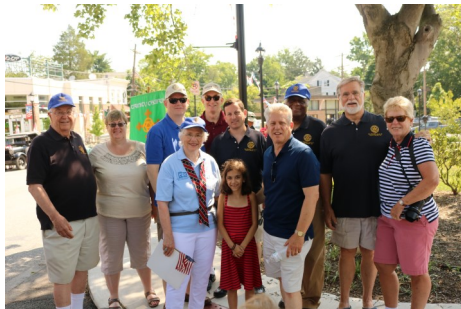
Gathering for the Parade